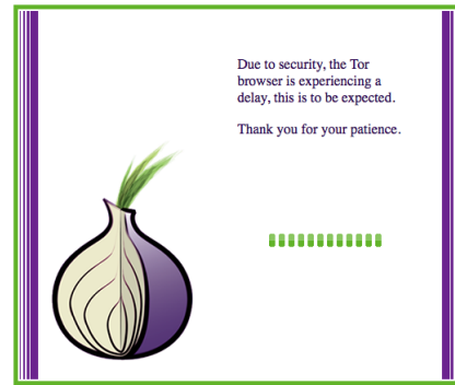
Fig. 1. Example of pop up informing users in Study 2 that a delay has occurred

Twenty-seven users reported a total of 34 individual issues. It should be noted that the category “Pop Up Peeves” was added in study 2, and refers to complaints about the messages