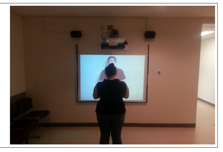
Fig. 1. Experimental Setup: (a) Side view (speakers over the door), (b) Front view

formance in the second condition, since, at that point, they would already know what to do and what might happen. Since subject observables (errors) are influenced by various individual characteristics, random subject selection ensures that any variation between sample and population observables is only a matter of chance.