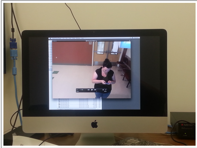
Fig. 5. Post-experimental review of video recordings (separate office)