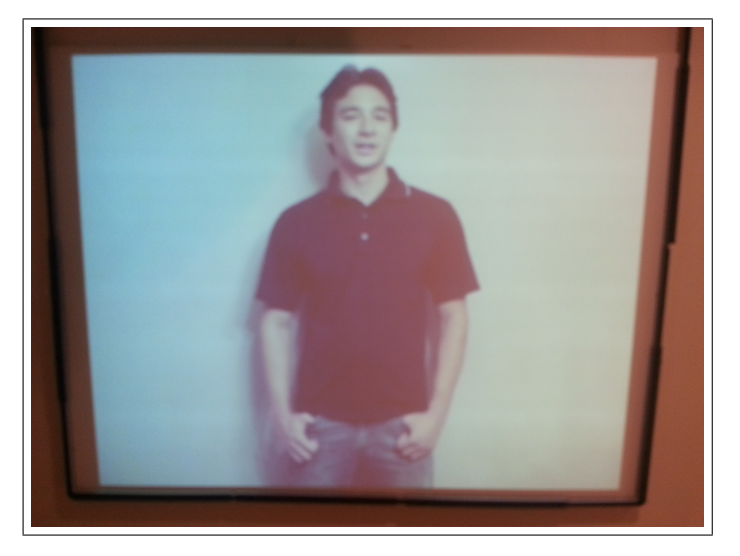
Fig. 3. Experimenter proxy giving video instructions