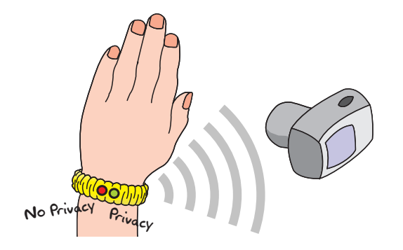
Fig. 3. For illustration to the reader only: The translated diagram explaining the Privacy Bracelet concept

scenario since it would allow them to express their privacy preferences in an unobtrusive way.