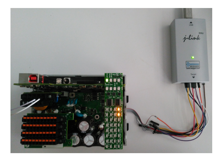
Fig. 2: PLC Infected with HARVEY using avatar^2 as instrumentation framework. The communication with avatar^2 is performed with a JTAG debugger.

Although the state-of-the-art in symbolic execution of binary software is steadily progressing, its application is often bound to rather simple software for a variety of reasons. The limiting factors can either be implementation constraints, such