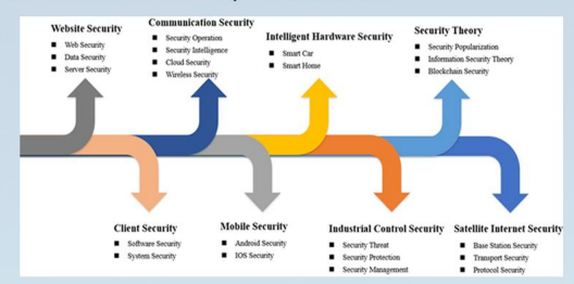
Fig. 2. Angle of the track of Cybersecurity Chess Manual

We propose an active defense strategy based on simulated attacks in different scenarios and design eight chess tracks in the field of network security(Fig. 2). and continue to collect The network security confrontation chess script of each track.