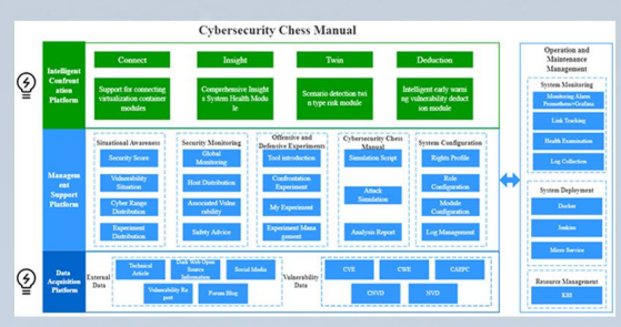
Fig. 3. Technical Architecture of the "Network security attack and defense platform"

Step 2: Build a network security attack and defense platform, quickly deploy lightweight attack targets such as operating systems, reproduce well-known technologies used in real attack scenarios such as BAS, VPT and other attack technologies, and CSMA, ShockTrap and other defense technologies, test and verify the effectiveness of relevant network protection detection tools.