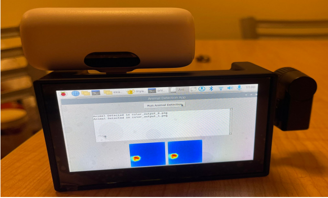
Fig. 2. AniLarm IoT Prototype for Small Animal Detection

users and systems. Req 5: Software Updates and Patching – Devices must support updates to address vulnerabilities. Req 6: Cyber Incident Detection and Response (CIDR) – Devices must detect and respond to security incidents effectively.